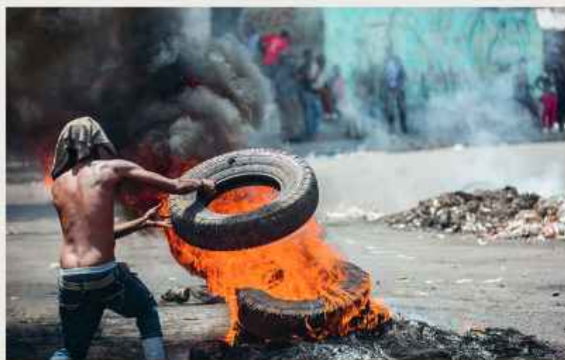
Left: A protester blocks a street with burning tyres during a political demonstration in Port-au-Prince in June 2019.

Haiti is facing a major crisis as poverty, rising fuel prices and political scandals fuel a massive upsurge in violence.