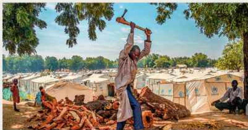
A man chops firewood in camp for displaced people in Bama.