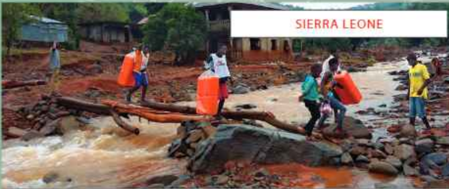
On 14 August, a mudslide on the outskirts of Sierra Leone's capital, Freetown, left 500 people dead, 600 missing and 3,000 homeless. Further flooding cut off communities, leaving them without access to clean drinking water. On 22 and 23 August, MSF teams crossed rivers to reach the community of Jah Kingdom with clean water and essential supplies for its 1,000 residents.