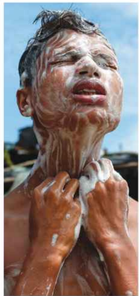
A boy washes in the open in Kutapalong makeshift camp.

We need 8,000 latrines built - that's a ratio of one latrine to 50 people. The longer the delay, the greater the risk of an outbreak of a waterborne disease. We need to supply two million litres of water per day just to provide five litres of water per person per day in one camp. We need huge amounts of food and emergency relief supplies to