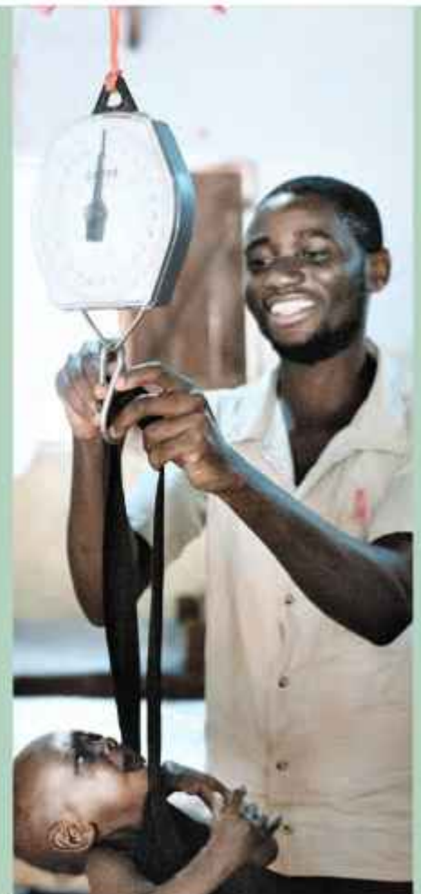
A small child is weighed at a therapeutic feeding centre in Tanzania.