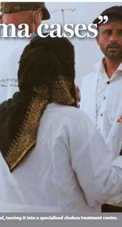
al, turning it into a specialised cholera treatment centre.

injuries so we had to feed her via a drip. But by the time I left, her wound was improving and her nutritional state was good. I'm hopeful that she'll do well. She certainly wouldn't have survived without the ICU.