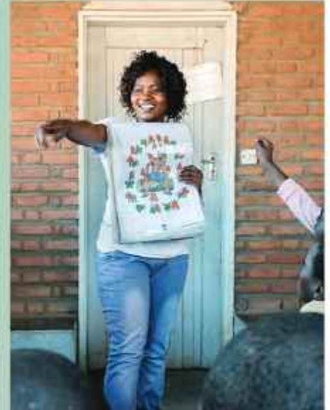
An MSF team member spreads the word about HIV in Malawi.