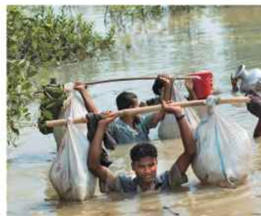
A Rohingya family reaches Bangladesh after crossing a river in Myanmar.

“Our teams in Bangladesh are hearing alarming stories of severe violence against civilians in northern Rakhine,” says Kleijer. “Villages and houses have been burned down, including at least two out of four MSF clinics. We fear that those remaining there are unable to access the help they may need. MSF and other international aid agencies must be allowed immediate and unhindered access to all areas of Rakhine State. Without this, there is a very real risk that people will die unnecessarily.”