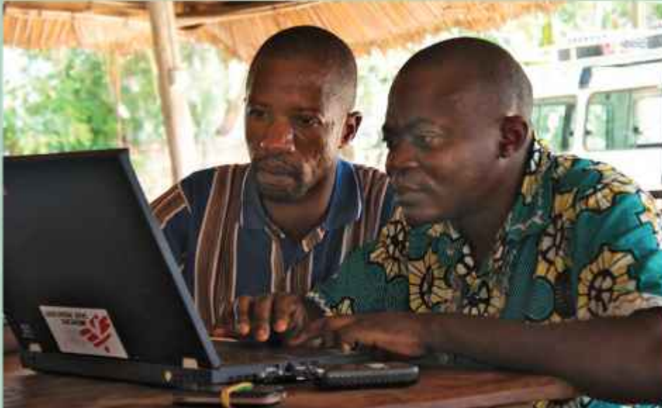
Team members consult records during an outbreak of malaria in Democratic Republic of Congo.

This project seeks to define the information needs in outbreak responses and enable sharing and analysis in a consistent and intelligent way. The aim is to ensure a joined-up, coordinated response, while at the same time reducing the burden on those gathering the data on the ground.