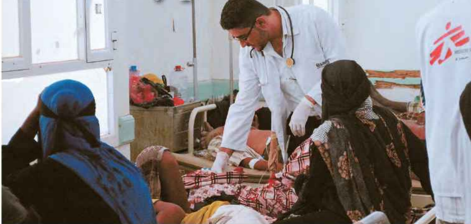
MSF medics treat cholera patients in Aden. As cholera spread across the country, MSF logisticians renovated an abandoned building next to the surgical trauma hospital.