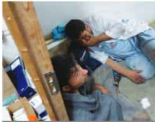
MSF staff comfort each other in the aftermath of the attack.