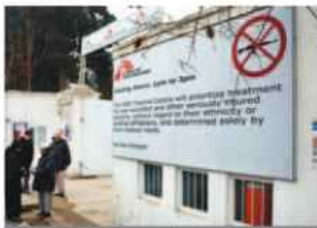
The MSF hospital opened in August 2011 and provided surgical care and physical therapy. It was the only trauma centre of its kind in the region.

The attacks took place despite the fact that MSF had provided the GPS coordinates of the trauma hospital to Coalition and Afghan military and civilian officials as recently as Tuesday 29 September. The attack continued for more