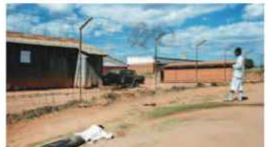
A prisoner sleeps on the ground after a night spent awake in an overcrowded cell. Built to accommodate 800 prisoners, Maula prison now houses 2,650 inmates.