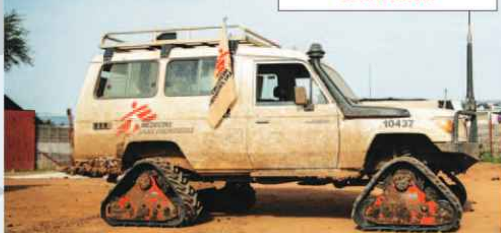
With many roads becoming impassable during the rainy season, MSF teams in Agok have come up with a novel solution to ensure they can continue to reach remote communities: fitting MSF Land Cruisers with specially designed tracks.