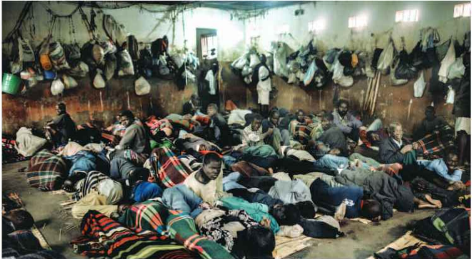
6 am, 25 May 2015. Prisoners in an overcrowded cell in Chikhi prison wait for permission to go outside after 14 hours locked up. Cell 5 is one of the most overcrowded in the prison and its inmates have the highest incidence of tuberculosis, hepatitis, malaria and HIV in the prison.