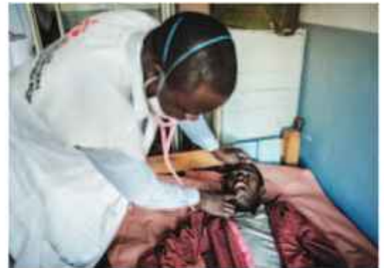
A member of MSF's medical team examines a patient. Detainees in Maula prison often suffer from poor health due to overcrowding and a poor diet.