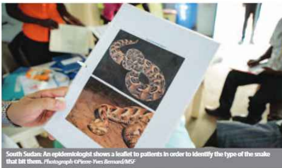
South Sudan: An epidemiologist shows a leaflet to patients in order to identify the type of the snake that bit them.

But by three days after the bite, the swelling had progressed to her shoulder. We gave her the antivenom through an IV infusion and within about six hours she was already having less pain. Her arm is still swollen and it will probably take a week or more for it to go back to normal, but she still has good sensation in her fingers and is able to move them. She should make a full recovery."