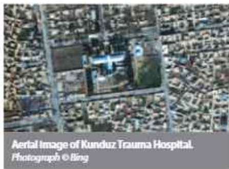
Aerial image of Kunduz Trauma Hospital.

For more information, visit: msf.ie/afghanistan