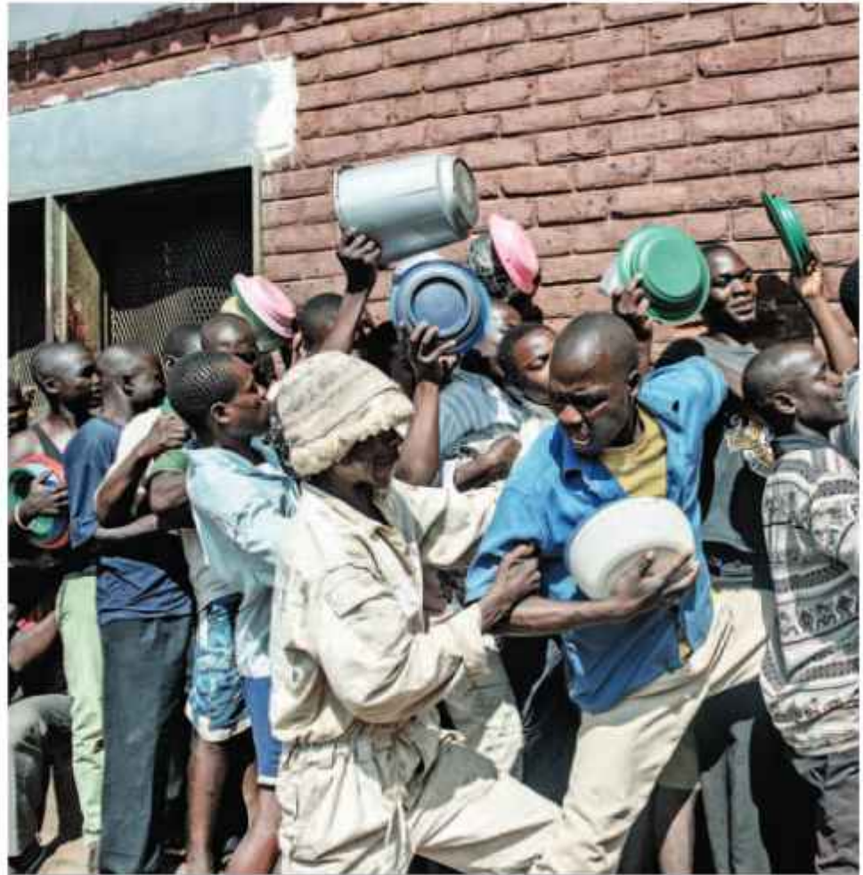
Food distribution in Chikhi prison. Prisoners are fed just once a day, due to the small budget that the Malawian government allocates to the penal system. The quality of the food is poor, with boiled corn flour served six days a week, and boiled beans once a week. As a result, many prisoners suffer from malnutrition.