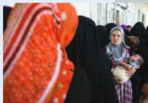
An Iraqi woman and her child wait for a consultation outside an MSF mobile clinic in Kirkuk, Iraq. Over the past year, more than three million people have been displaced within Iraq due to aerial bombings and the advances of Islamic State. MSF teams are operating mobile clinics throughout the Kirkuk region and beyond, providing medical care to Iraqis fleeing conflict.