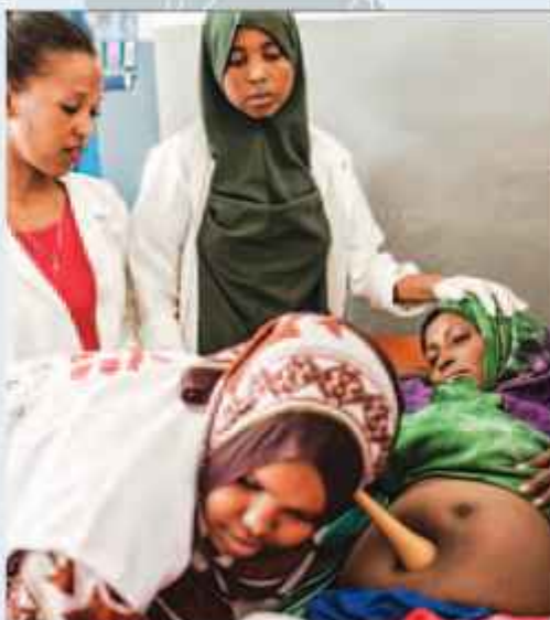
A pregnant woman is examined by MSF staff in Fiq hospital, in eastern Ethiopia. This is the only hospital in the region where women can get free antenatal and postnatal care.