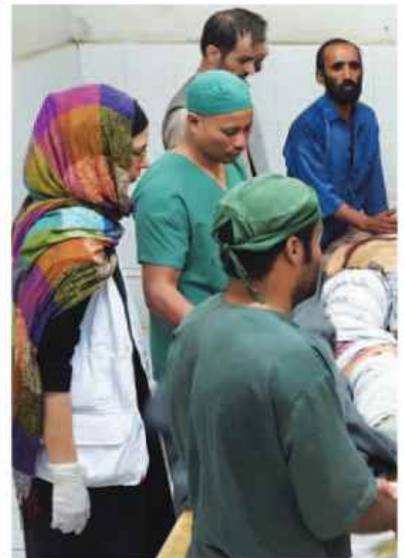
MSF staff treat wounded colleagues and patients in the immediate aftermath of the bombing.

From 28 September, when major fighting broke out in Kunduz city, until the time of the attack, MSF teams in Kunduz had treated 394 wounded people in the