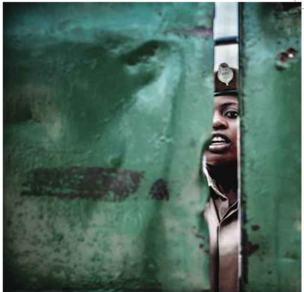
Chichiri prison, 27 May 2015. A prison guard closes the main gate as she shouts to prisoners' relatives that visiting time is over as well as the prisoners.