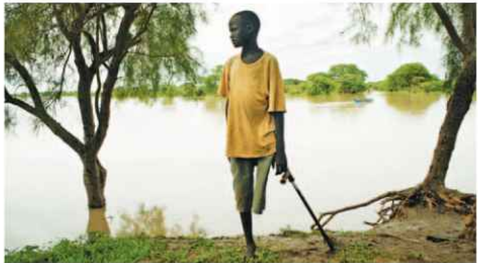
A South Sudanese boy had his leg amputated after being bitten by a snake. Most victims of snakebite live in remote rural areas where access to healthcare is limited.

Fav-Afrique, produced by French pharmaceutical company Sanofi, is the only antivenom that has been proven safe and effective in treating bites from more